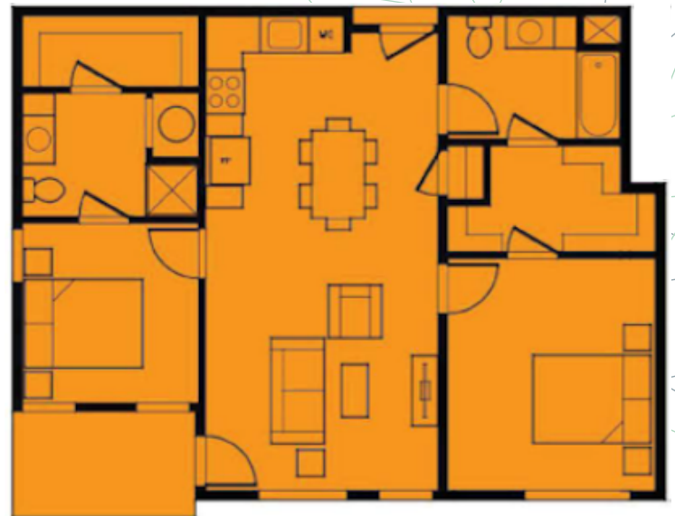
Floor Plan 2B 959 sq.ft.