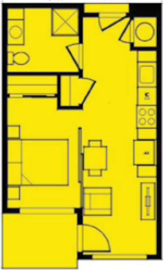
Floor Plan 1A 448 Sq. Ft.