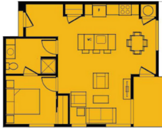
Floor Plan 1B 698 sq.ft.