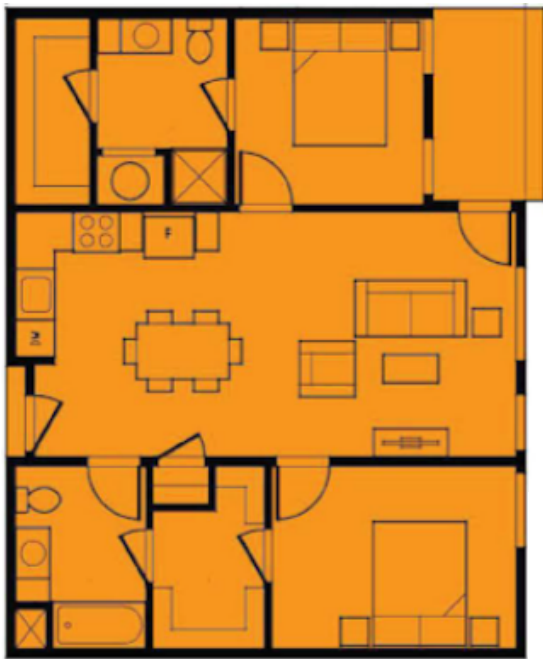
Floor Plan 2A 923 sq.ft.